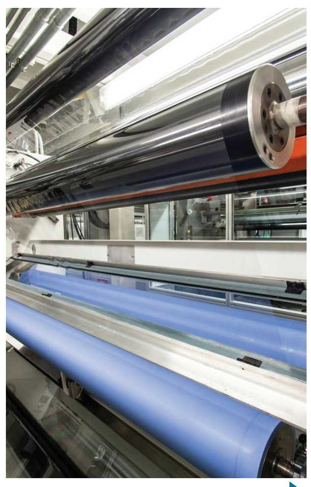
See other side for our breakdown of the 1-2-3 Program Phases.

work on real-world machinery that is found in leading performance film companies. However, 80% of what the students learn is applicable to any advanced manufacturing environment.